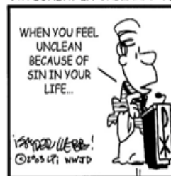
6TH SUNDAY IN ORDINARY TIME