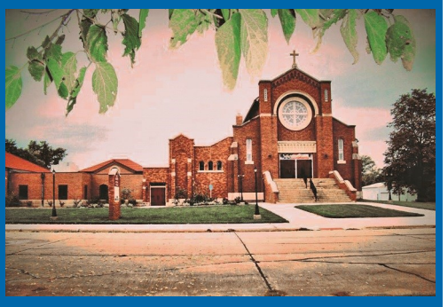
St Bernard 201 Main St. Blencoe, IA