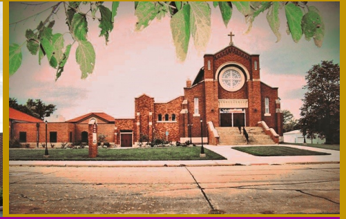
ST JOSEPH 510 Tipton St., Salix, IA