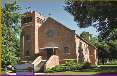
ST BERNARD 201 Main St. Blencoe, IA