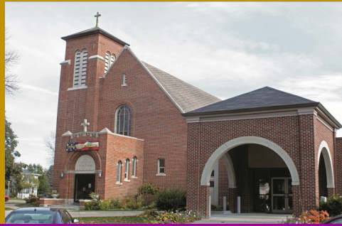
ST JOHN 1009 13th St., Onawa, IA