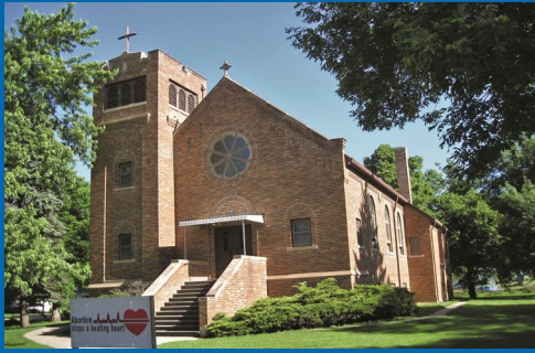
ST BERNARD 201 Main St. Blencoe, IA