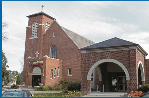
ST JOHN 1009 13th St., Onawa, IA