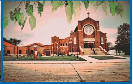
ST JOSEPH 510 Tipton St., Salix, IA