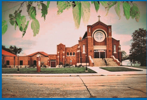
ST BERNARD 201 Main St. Blencoe, IA