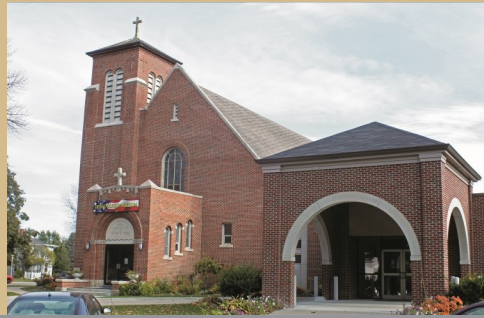
ST JOHN 1009 13th St., Onawa, IA