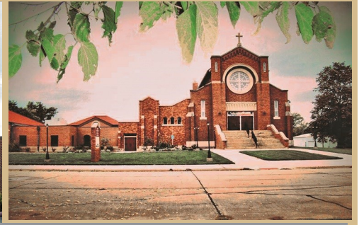
ST JOSEPH 510 Tipton St., Salix, IA