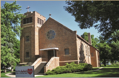
ST BERNARD 201 Main St. Blencoe, IA